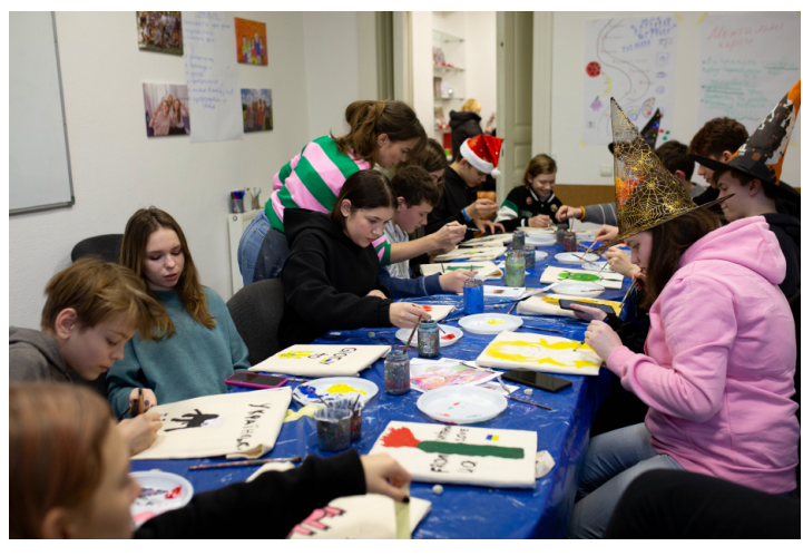
Tote bag painting